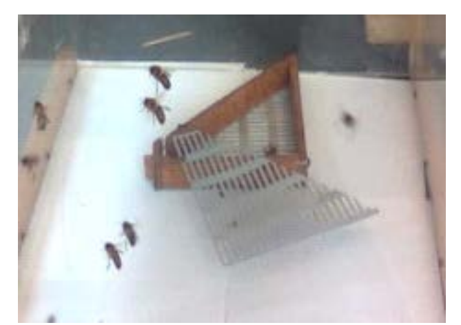
Fig (1) Small wooden material used in collecting drones in front of colony's entrance inside mish wire box (30×30×50)

Drones were collected from the colony's entrance by hand in different two times per day at 13.30 h - 14.30 h and 15.30 h - 16.30 h. It was found that the best time for collecting drones was after 1:00 pm that's because at this time drones were more active and flying for orientation or mating with queens, through 4 months from May to August under different weather like temperature, humidity and wind speed (Table. 2). Then putted in small wooden box and transferred them to the lab. for collecting semen. But before collected semen opened small wooden box inside the mish wire box (Fig. 1), then it was left 15 mints until drones flying inside the mish wire box (30×30×50) to increase the volume inside the abdomen by forcing air into the air sacs through lighting the box internally then drones collected by hand according to (Hassona, 2006 and Hassona et al. 2012).