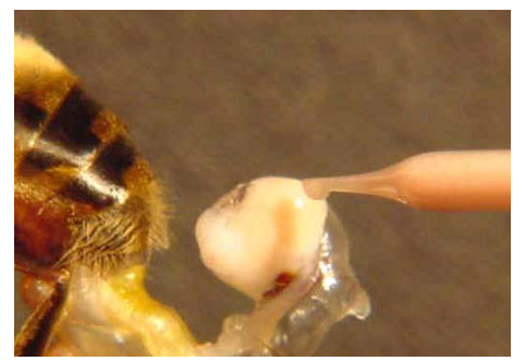
(A) The semen covering the mucus.